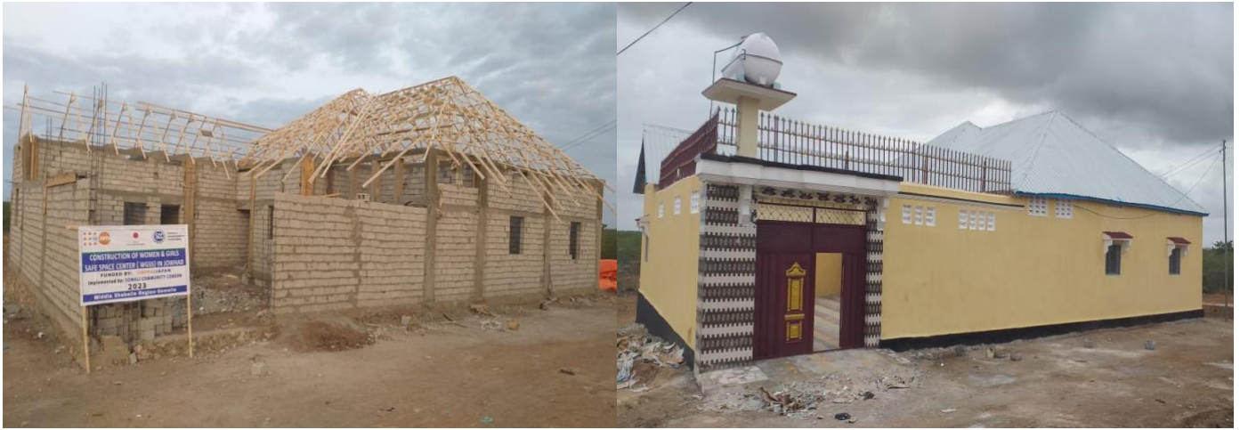
Construction of Women & Girls Save Space Center