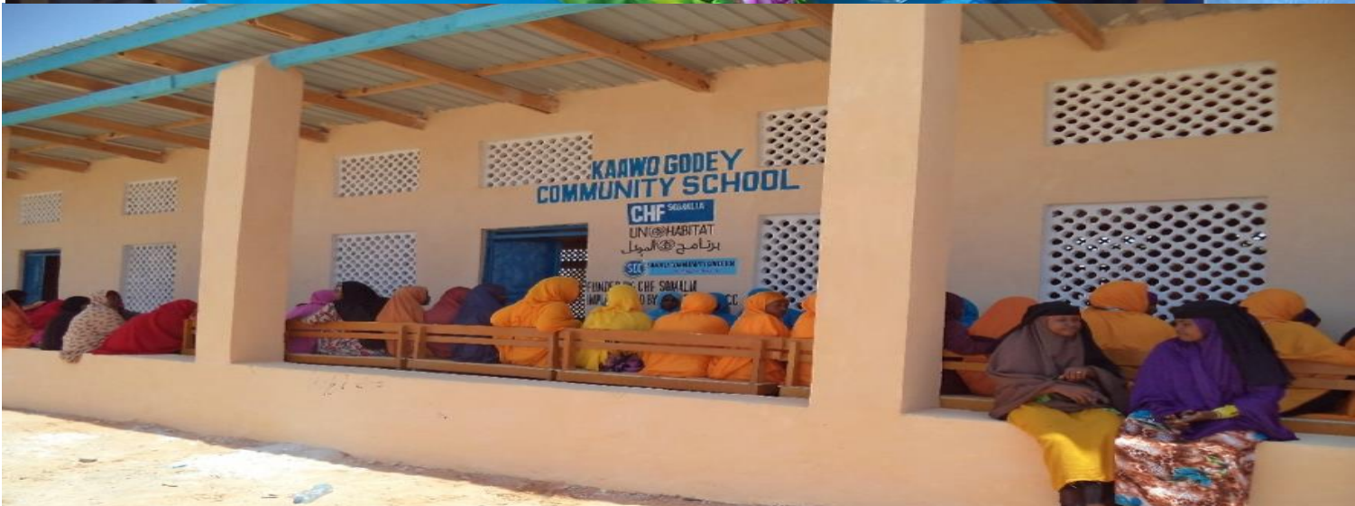
Opening Ceremony of Kawo Godey P&S School